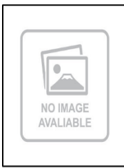
Trevor Mcsparron (Co-opted member, Peterborough Cycle Forum)

Officers supporting the Task and Finish Group were: